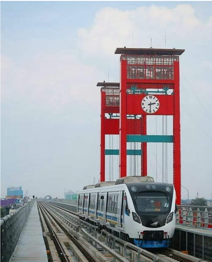
Asian Games XVIII Palembang, Jembatan Ampera, 2 Agustus 2018