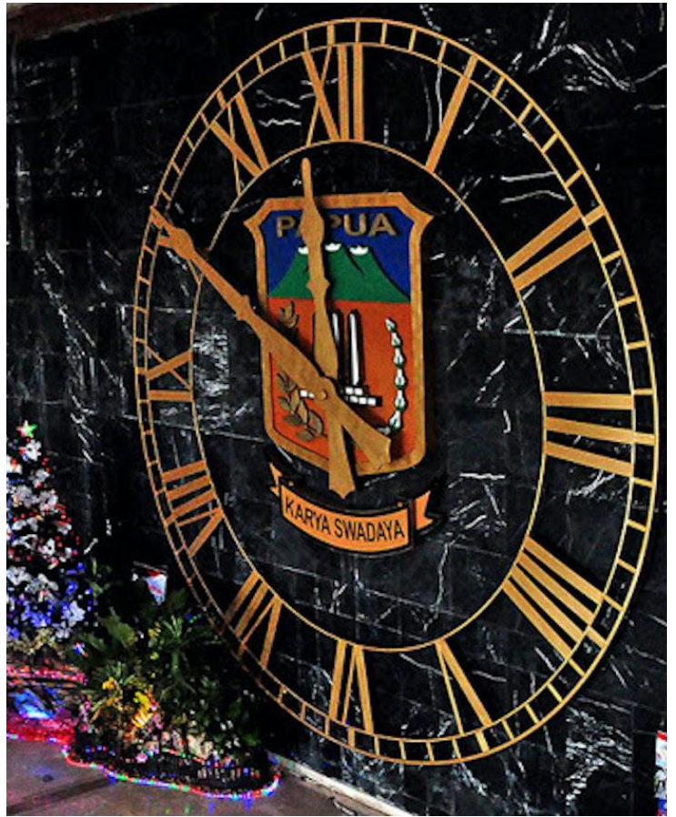
Jam Besar diameter 650CM di loby kantor Gubernur Papua di Jayapura dibangun pada tahun 2014