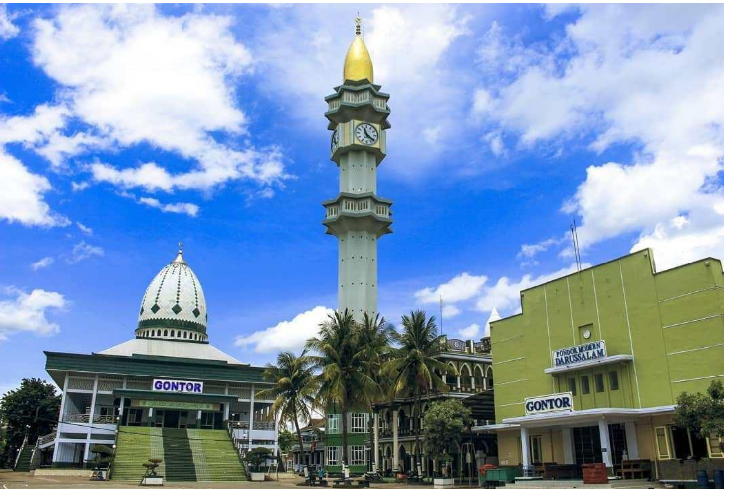
Menara Masjid Jami Gontor dibangun dengan ketinggian 85 meter, dilengkapi dengan 4 jam analog ukuran besar dengan diameter jam 4 meter di empat sisi arah mata angin.

Peletakan batu pertama dilaksanakan pada tahun 2016 oleh Bapak Presiden RI dan Pimpinan Pondok, peresmian dilakukan oleh Bapak Jusuf Kala, tahun 2018